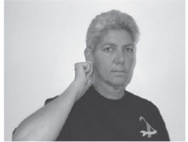
Figure 16.3. Closeted sign for GAY.